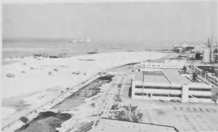
Top picture shows old canal, looking west from Powerhouse No. 2, as it was during HDS-1 construction. The picture below is an aerial view of the old canal before the HDS-1 Project.

E portret aki riba ta muntra e canal bieuw, mirando west for di Powerhouse No. 2, manera e tabata durante construccion di HDS-1. E portret aki bao ta un portret aereo di e canal bieuw promer Proyecto Desulfurador-1 a ser construi.